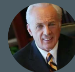
Grace to You John MacArthur