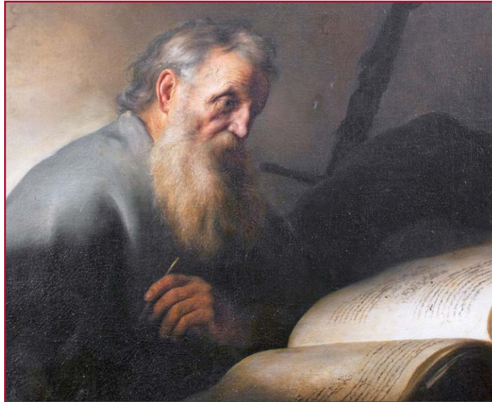
“Apostle Paul,” Jan Lievens (1607–1674), Nationalmuseum, Sweden

The apostle Paul experienced betrayal throughout the course of his ministry—and I am sure you and I will too. Such is normal in the life of the believer according to the Bible. So don’t be surprised when it happens to you. Sage believers will counsel you that God uses wounded followers of His in the mightiest of ways.