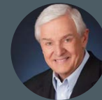
Turning Point David Jeremiah