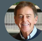
Truth For Life Alistair Begg

Throughout biblical history, God has set aside and equipped specific men to accurately teach His Word (Romans 10:15, Ephesians 4:11–13). We are blessed in our time to have an abundance of outstanding preachers and their sermons are available to you. Build your faith and Bible knowledge through the consistent hearing of God’s Word (Romans 10:17). Hear biblically accurate exegesis from these excellent preachers anytime at oneplace.com .