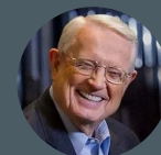
Insight for Living Chuck Swindoll

Mature in your faith, and receive the blessings God has prepared for you by listening to biblically correct sermons from these faithful and superb master Bible teachers.