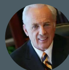
Grace to You John MacArthur