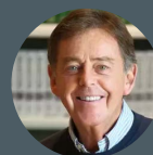
Truth For Life Alistair Begg

Throughout biblical history, God has set aside and equipped specific men to accurately teach His Word (Romans 10:15, Ephesians 4:11–13). We are blessed in our time to have an abundance of outstanding preachers and their sermons are available to you. Build your faith and Bible knowledge through the consistent hearing of God’s Word (Romans 10:17). Hear biblically accurate exegesis from these excellent preachers anytime at oneplace.com .