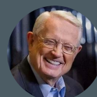
Insight for Living Chuck Swindoll

Mature in your faith, and receive the blessings God has prepared for you by listening to biblically correct sermons from these faithful and superb master Bible teachers.