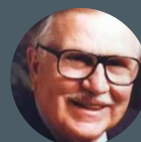
Thru the Bible J. Vernon McGee