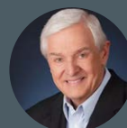
Turning Point David Jeremiah