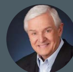
Turning Point David Jeremiah