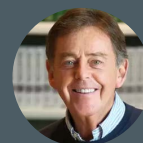
Truth For Life Alistair Begg

Throughout biblical history, God has set aside and equipped specific men to accurately teach His Word (Romans 10:15, Ephesians 4:11–13). We are blessed in our time to have an abundance of outstanding preachers and their sermons are available to you. Build your faith and Bible knowledge through the consistent hearing of God's Word (Romans 10:17). Hear biblically accurate exegesis from these excellent preachers anytime at oneplace.com .