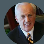
Grace to You John MacArthur