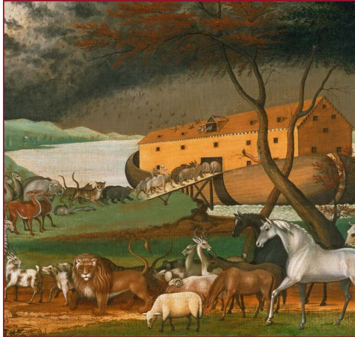
Noah's Ark, Edward Hicks, Philadelphia Museum of Art

The intention of this chapter is to expand our understanding and the implications of what the Bible instructs the believer regarding faith. We will see that without faith it is impossible to please Him (Hebrews 11:6) and that properly understood, the biblical concept of the believer and faith extends far beyond the walls of soteriology, i.e., the doctrine of salvation. In other words, without faith it is impossible to please Him means much more than placing our trust in Him relative to salvation.