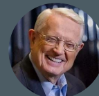
Insight for Living Chuck Swindoll

Mature in your faith, and receive the blessings God has prepared for you by listening to biblically correct sermons from these faithful and superb master Bible teachers.