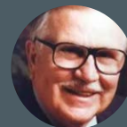
Thru the Bible J. Vernon McGee